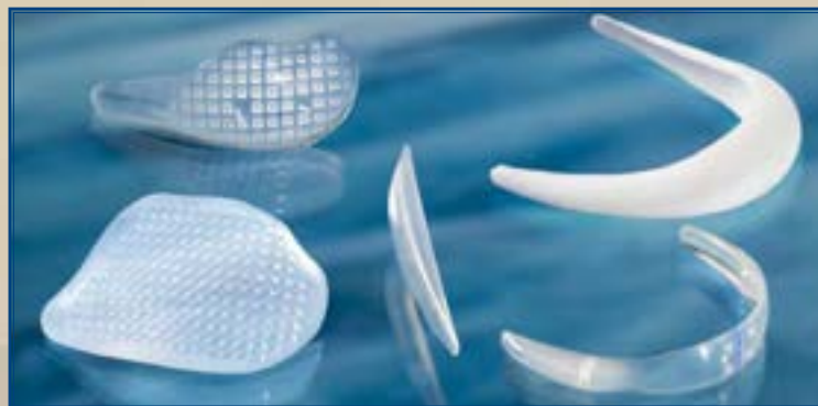
Elevate patient satisfaction with Implantech

Implantech ® Superior Patient Aesthetics 800.733.0833 | implantech.com